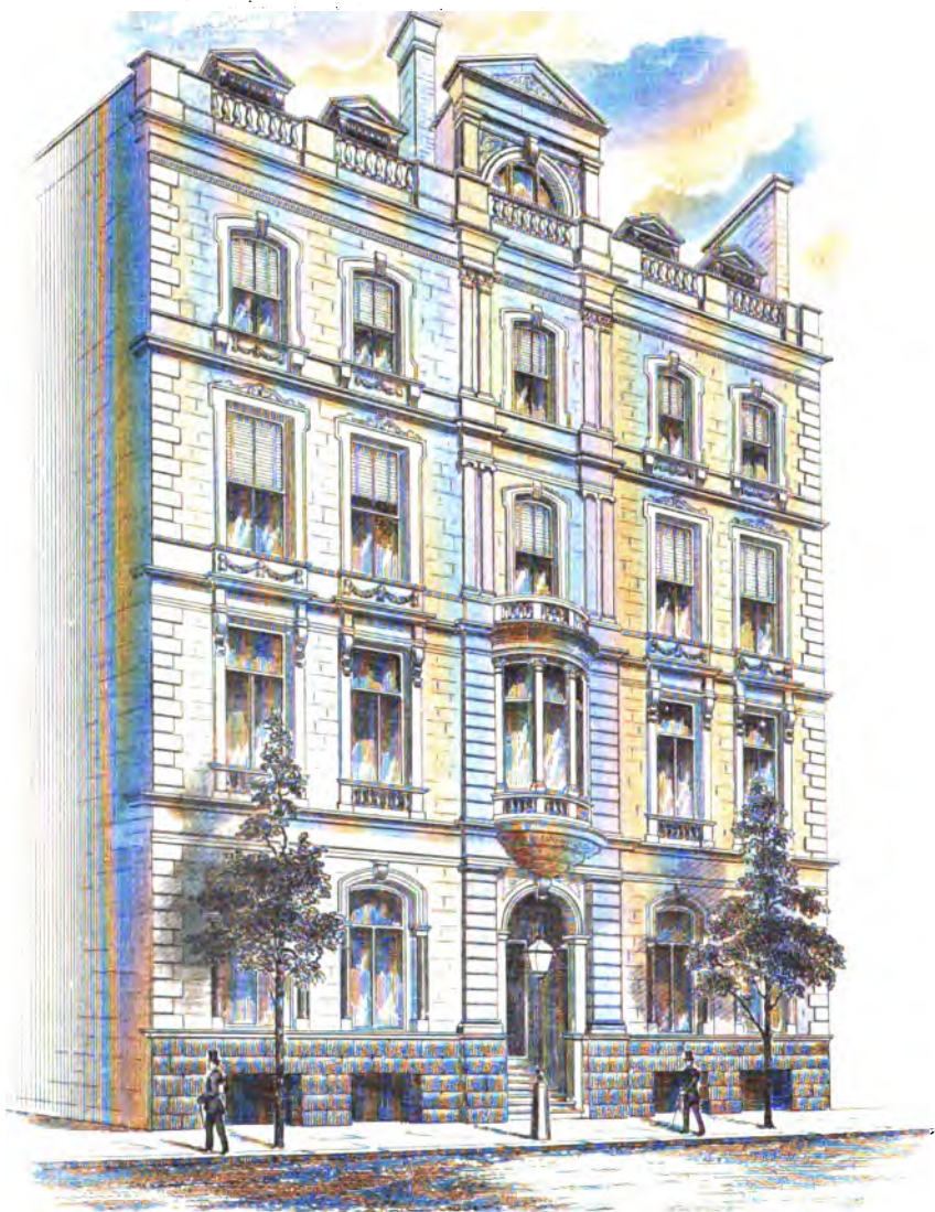
FAÇADE OF THE INSTITUTE BUILDING.